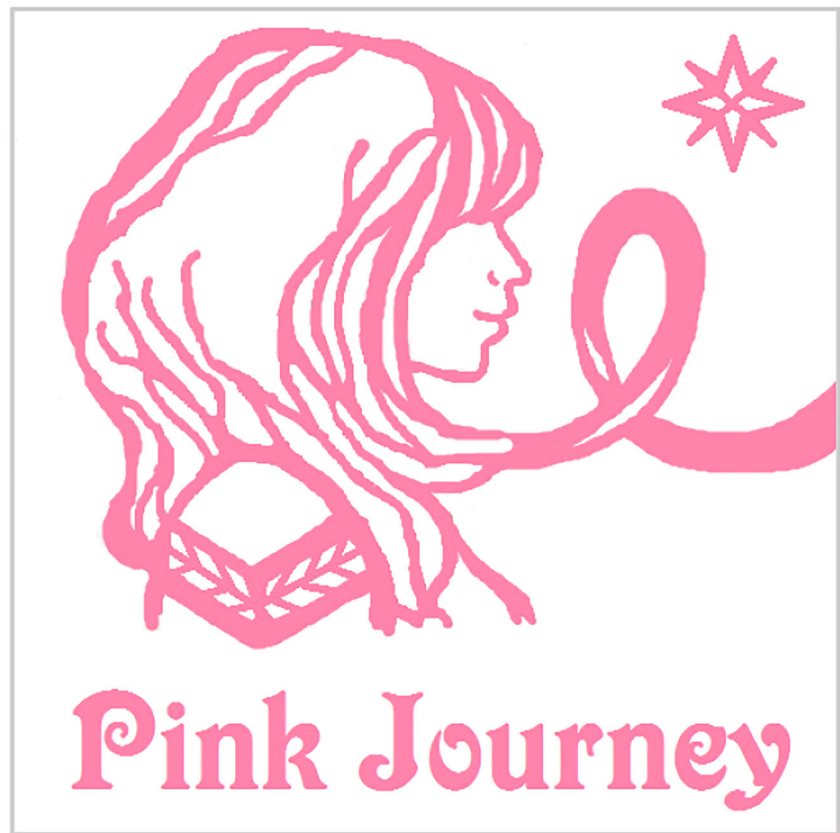
Fig. 1 The logo of Pink Journey

alone, implant-based breast reconstruction, and autologous breast reconstruction) is presented in terms of their concerns.